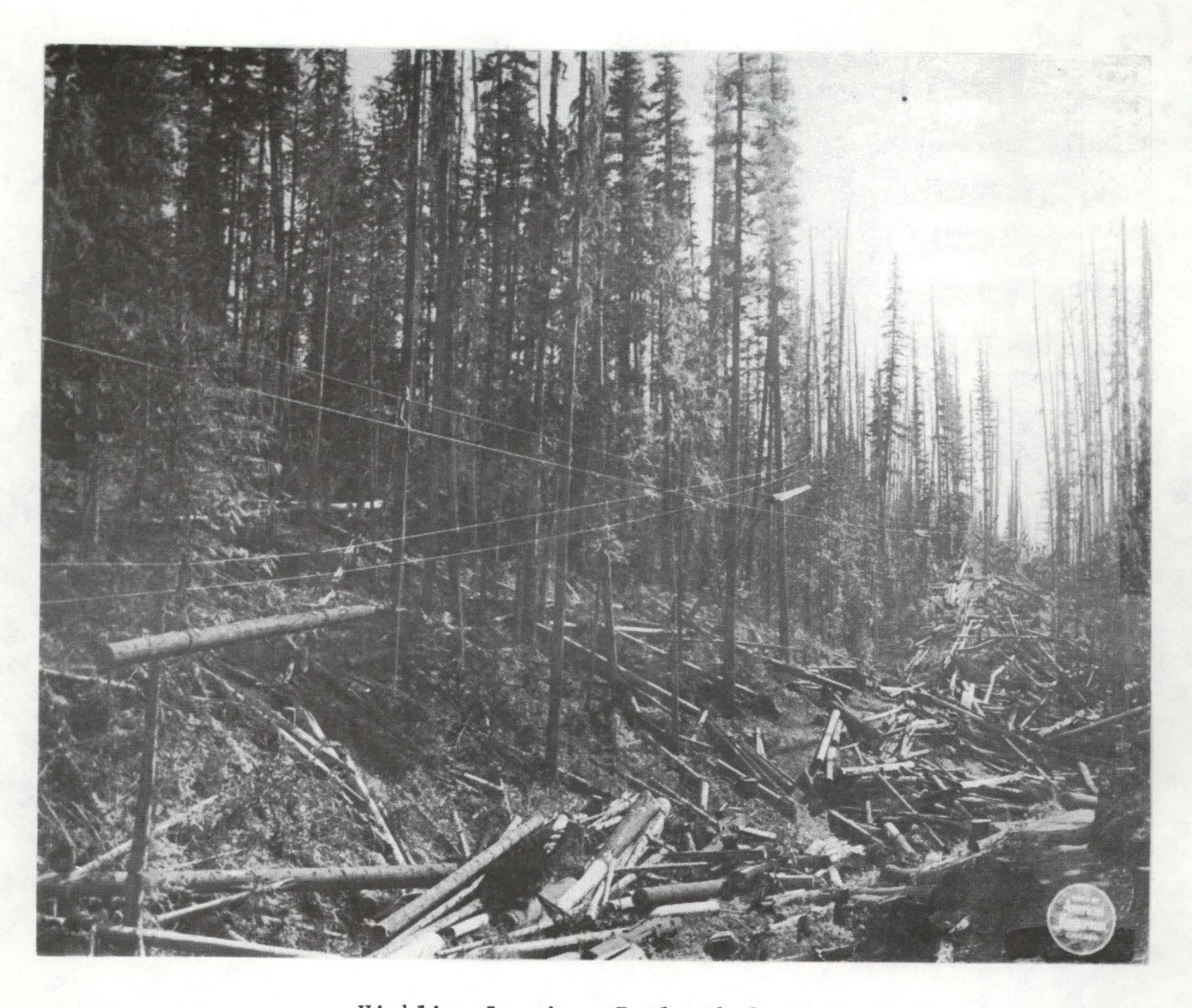
Highline Logging, Potlatch Corp.

sists of three men, an under-cutter and two sawyers. Several of these crews may be kept busy at each donkey. The hooktender attends to the attaching of the logs to the pulling cable. The whistle boy is stationed at some point on the whistle line where he can see the full length of the pulling cable. His duty is to transmit the signals of the hooktender to the engineer by means of the wire attached to the whistle. The chaser is a man employed to watch for trouble along the line and to assist in getting logs past the pulleys.