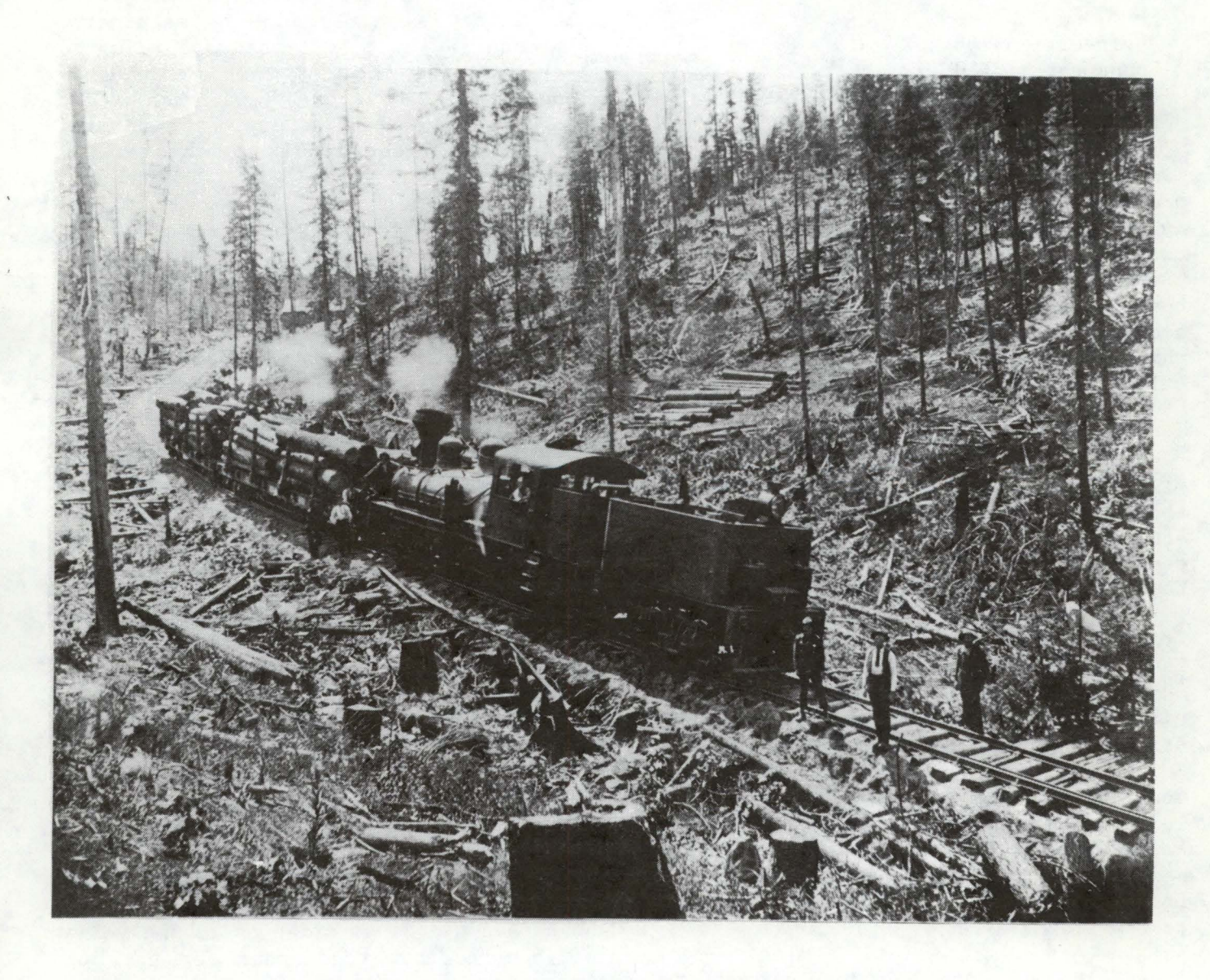
Logging train coming down a grade, Potlatch Corp.

The yard contains 95 to 100 million feet of lumber.