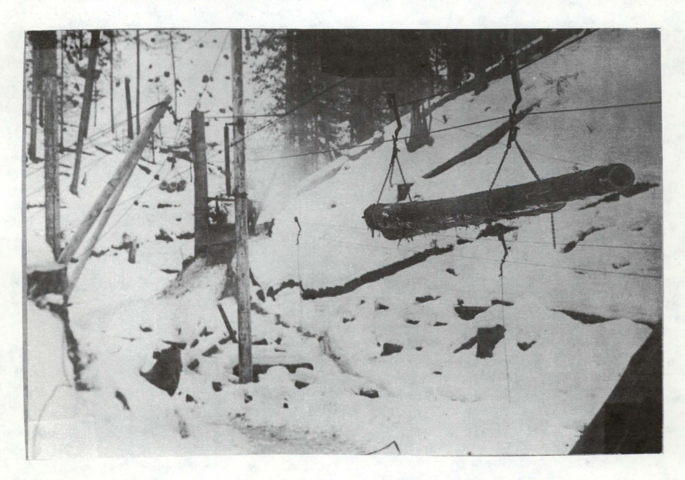
Highline Logging, with Donkey Engine

Organization. At Camp Eight 76 men are employed. The crew employed at a donkey is about as follows: engineer, fireman, loader, sawyers, hooktender, fellers, The wages of the chaser, whistle boy. engineer are $3.50 per day; of the hooktender $3.50; the fellers are $2.75 to $3.25; the loader $2.75; the sawyers' $2.25 to $2.75; and the whistle boy $2.25. The fireman, besides keeping up steam runs the small loading engine. The loader superintends the cutting of the logs into proper lengths and the loading onto cars; the sawyers cut the logs into 32 foot lengths at the car, and assist in loading. One sawyer is kept busy cutting wood for the engine. The normal felling crew con-