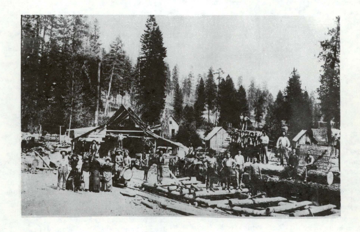
Webster's Mill, Deep Creek, c. 1890

It was not unusual at that time to find extensive fruit orchards scattered over the Palouse hills. ^{16} The fruit raised in the Palouse was of high quality and there were many local packing and ship-