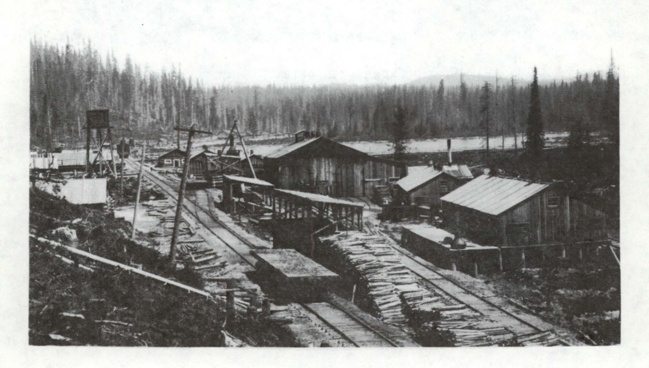
Potlatch Camp 5, c. 1910

Besides the donkey loaders the company owns two kinds of patent loaders which are easily transported. The McGiffert loader is made to run on the track. When used as a loader the wheels swing up out of the way allowing the empty cars to run under it. One of these machines costs $2800. The Marion loader runs on a track on the cars themselves. It has not been