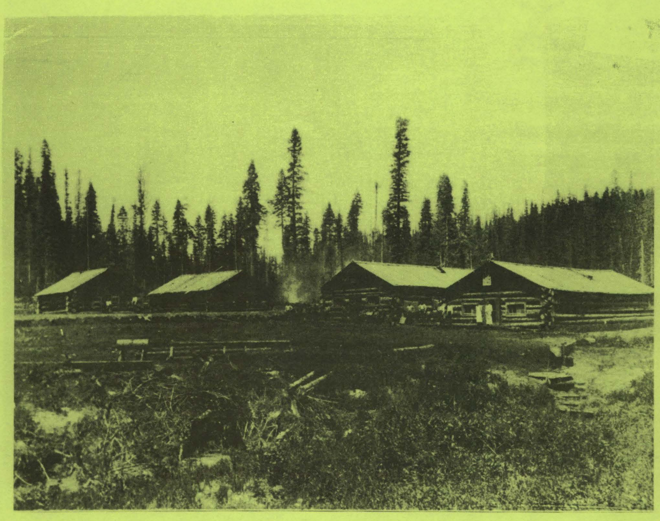
ONE OF OUR LOGGING CAMPS.