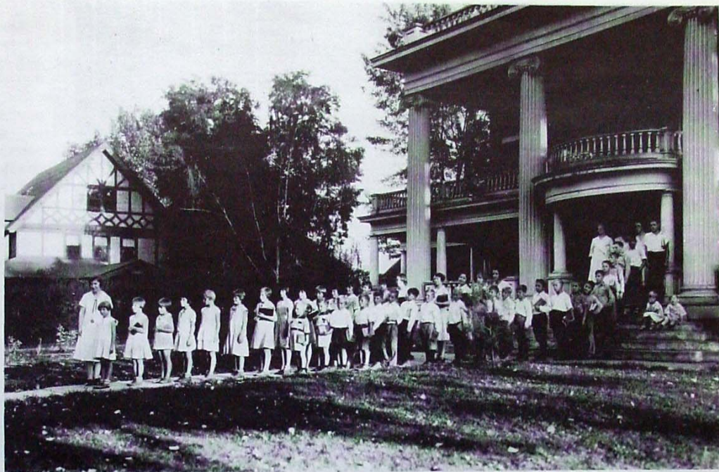
The children are ready for school: girls in one line, boys in the other.

they believed the benefits of their work extended to the child, the foster parents, and the state.