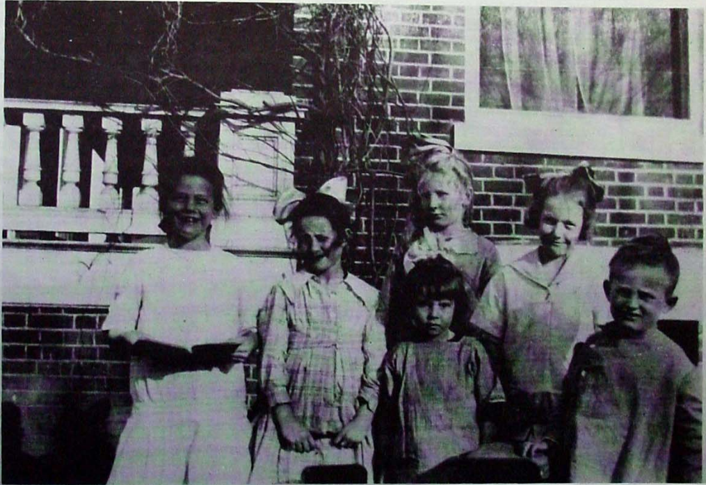
Children upon arrival at the Receiving Home.