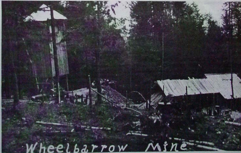
The Wheelbarrow Mine supposedly in operation

"Recent finds have tended to muddle Casper's story. Indications point to the fact that the tunnel mouth was blasted with black powder by Casper in the hope of forever sealing the murder secret. A rifle, cocked and loaded, burned and partly melted in a forest fire of nearly 55 years ago was recently found nearby, leading to the theory that Casper may have shot his partner, blasted the tunnel and left to spend the $20,000 in gold. At any rate the location of the stream and spring near the mine, the fact that two trees grew near the tunnel entrance, the finding of the human bone and the wheelbarrow inside the tunnel coincide exactly with